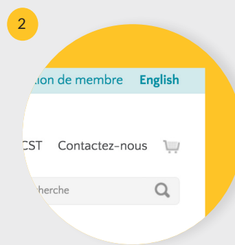
Fully Mirrored French site