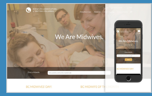
Midwives Association of British Columbia